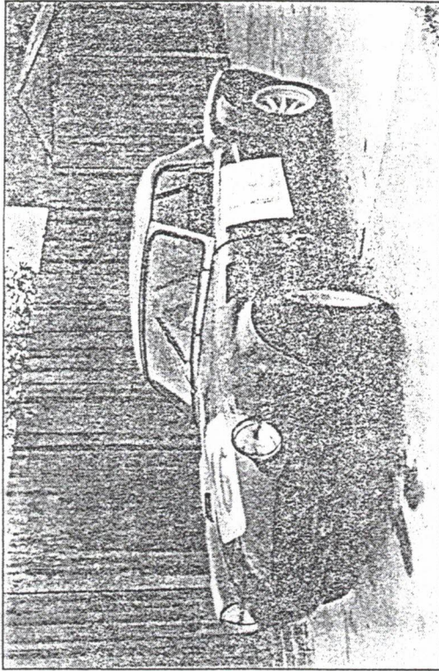
Fierce-looking Le Mans Spitfire is now back in the hands of its original owner